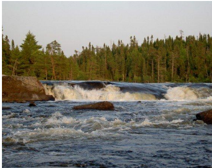
Click Here for Slide Show of a Typical VWP Quetico Wilderness Trip (may take a few minutes)

IEEIA: This workshop will familiarize participants with environmental issues of the Great Lakes area and Boreal Forest biome. Participants will gain skills that can be used with learners to help them understand and address issues related to the environment in their local communities. These include environmental issues, health issues, and other science-related issues. After you master this nationally-acclaimed curriculum, you will be ready to try it in your own teaching situation. Designed for all who work with middle school or high school learners, the workshop will inspire teachers of science, language arts, social studies, and agriculture, as well as non-formal environmental educators.